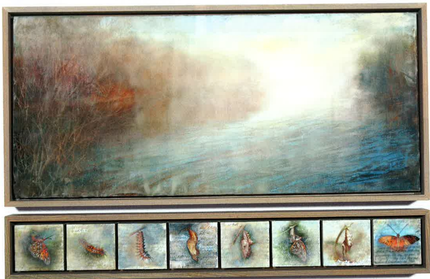
Patricia Beggs, Before Going (diptych), oil, butterfly wing and beeswax on panels, 16 x 36" (panel 1) and 4 x 36" (panel 2)

The ability to make words and to form words into conversation is one of the many wonders of our evolutionary development. Edgar Degas wrote, "Conversation in real life is full of half-finished sentences and overlapping talk. Why shouldn't painting be too?" The three artists in the exhibition Words with Friends at Gerald Peters Gallery in Santa Fe, New Mexico, weave written words into their works, implying the depth of conversation with the actual depth of layers of wax or cut paper words floating in space.